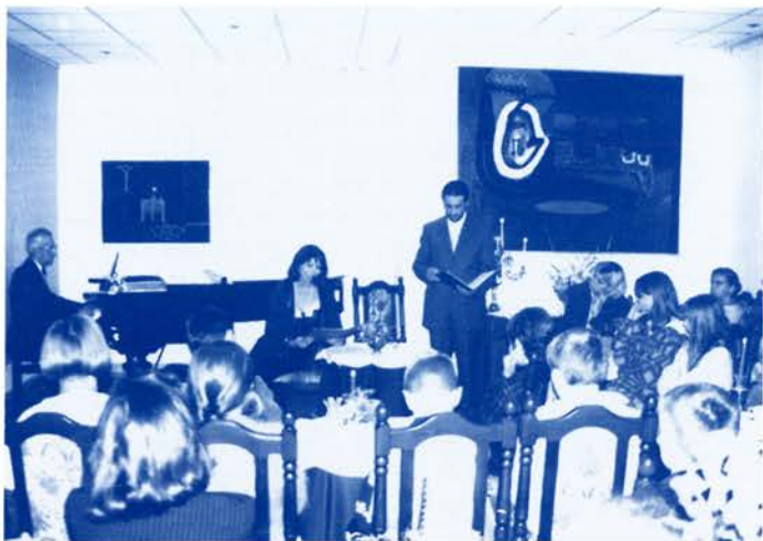
XLIV Concert for disabled people in the club of the Building Society in Trzebnica, 21st September 1997.

We also edited and published 3 consecutive issues of the TiFL Bulletin in three languages: Polish, German and English.